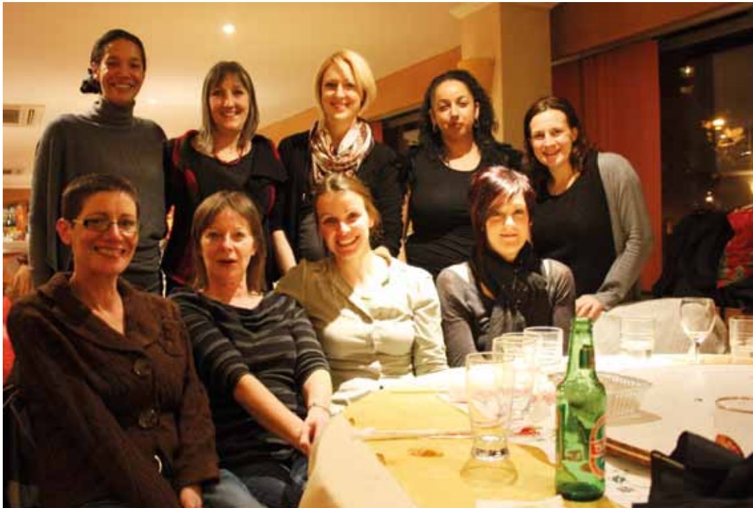
Some of our Outreach team